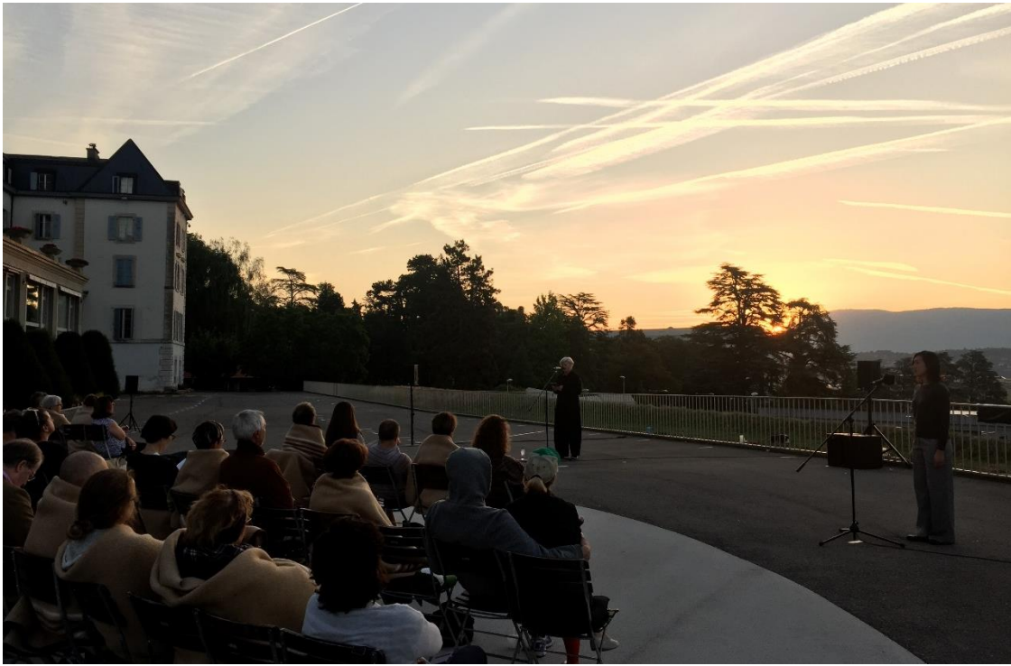
Festival la Batie, Geneva.