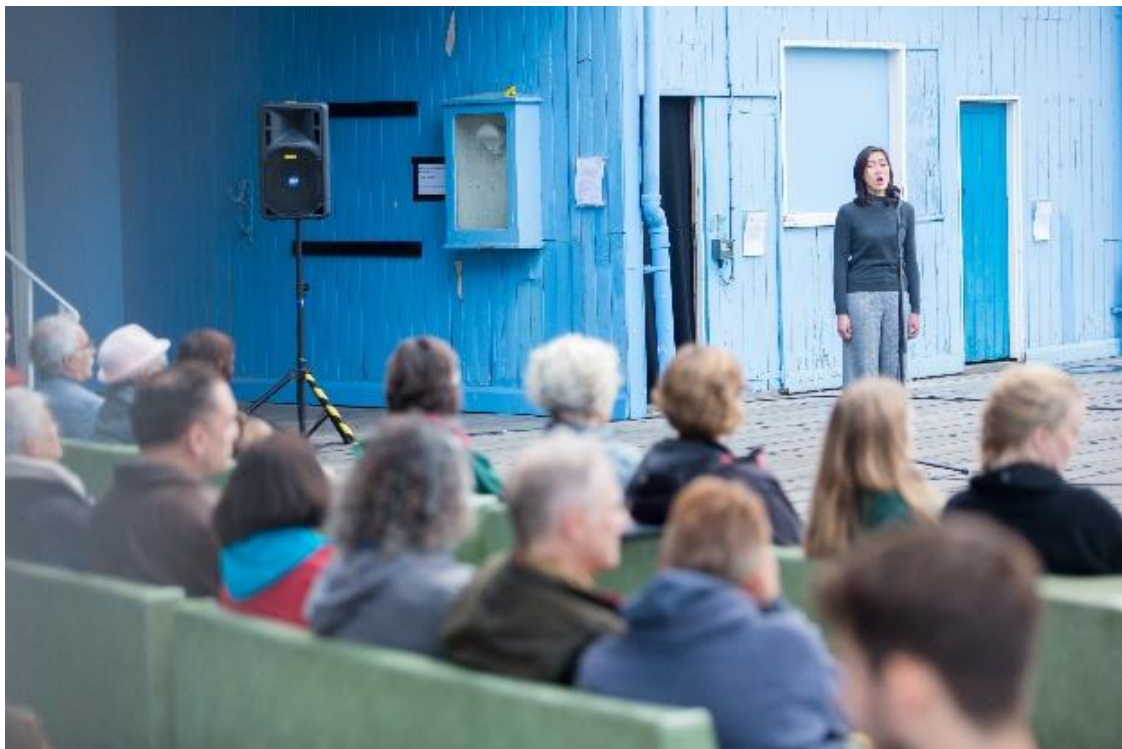
Estuary Festival, Tilbury.

Estimated reach = 6,332,634 (Gorkana/ RAJAR figures)