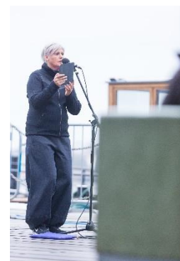
Estuary Festival, Tilbury.