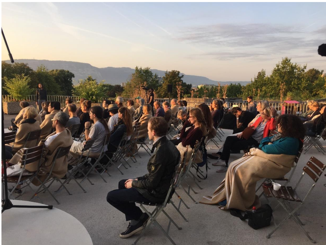
Museum of the Red Cross. Festival la Batie, Geneva.