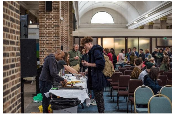
Estuary Festival, Tilbury.

Directly following the performance is a communal breakfast . The breakfast is integral to the performance, is made using specific local foods and is offered to the audience. It creates an opportunity to participate in collective discussion, to involve and reconnect oneself to time, place and each other. It is designed to deepen the audience's experience of the work and strengthen the shared experience of the sunrise. Judging from the leisurely time audiences and the project's team spent together enjoying breakfast after the 2016 performances, this is a very welcome and important slow closure to the work.